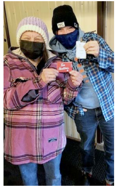
PLAID DAY AT NEWCASTLE