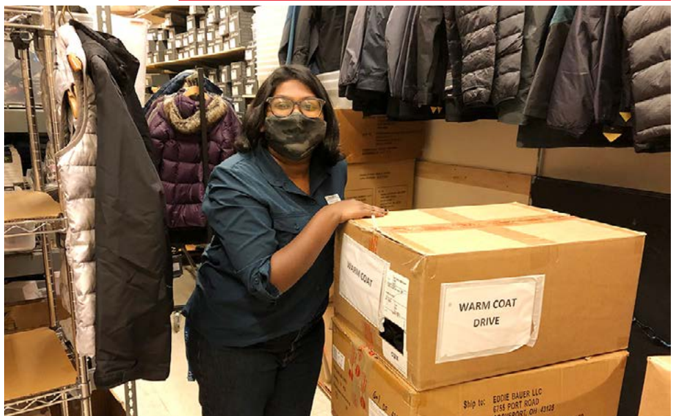
ONE WARM COAT - EDDIE BAUER