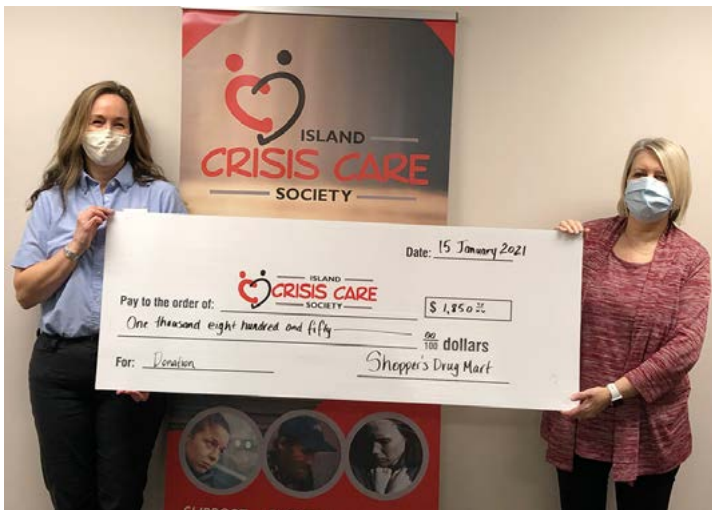
SHOPPERS DRUG MART