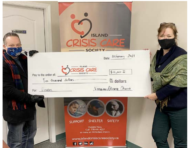
NANAIMO ALLIANCE CHURCH

CCS is continually blessed by amazing donors who go out of their way to meet the needs of our clients in wonderful ways. Through the past months there have been many wonderful donations, both in kind donations and much needed funds to help our programs serve our clients in the best way possible. We are grateful for them all. Here are just a few pictures of some of the wonderful things that have come to our programs recently.