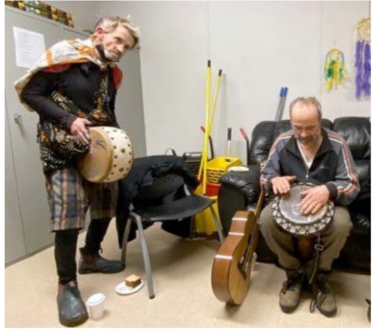
ROCKIN' THE JAMS