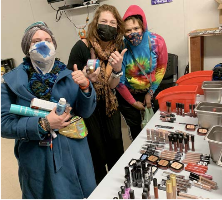
LADIES AT NEWCASTLE HAVING A MAKEOVER

All client events drew together staff and clients in really heartwarming and positive way.